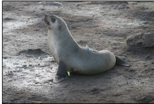
Tracker deployments on Maggie and Nym at Seal Rocks in July.