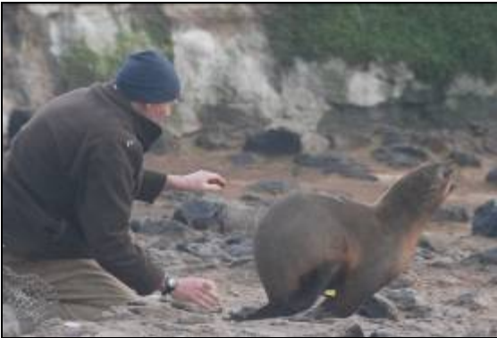
Scrappy relieved of trackers