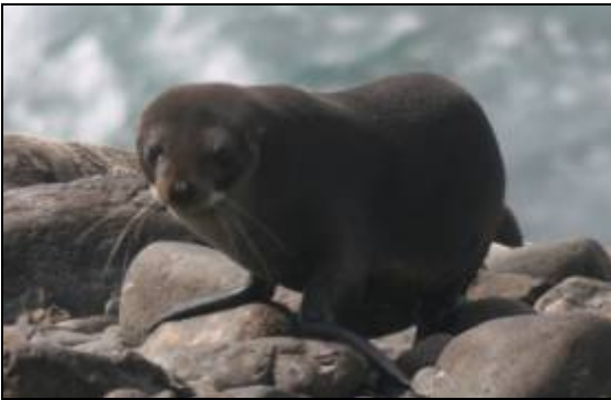
Subantarctic fur seal juvenile