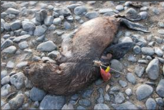
Dead seal entangled in squid jig and line