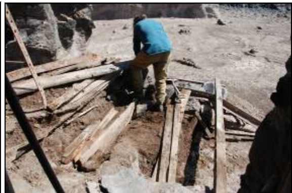
New step to support hut corner and organizing timber pile at back of hut