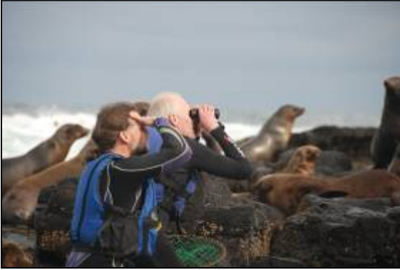
Tracker recovery operations