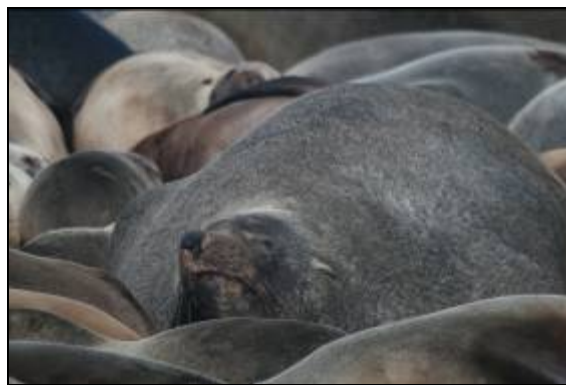
Seals on main beach